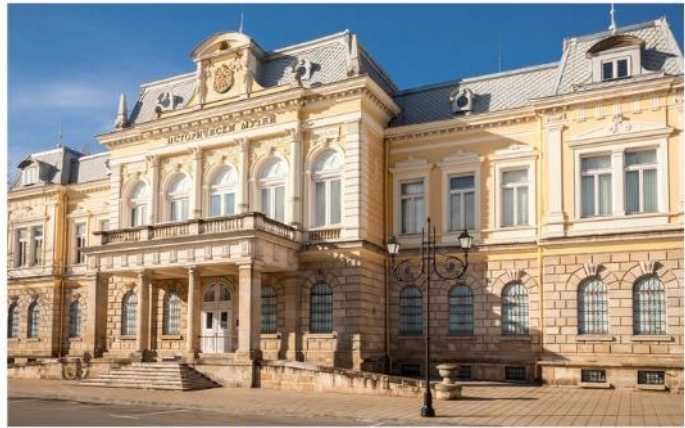
Regional History Museum Ruse