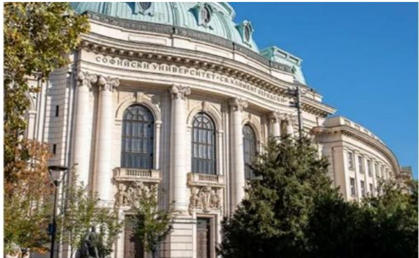
Sofia University "St. Kliment Ohridski"