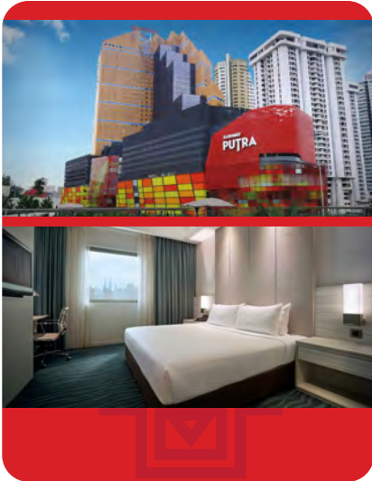
Sunway Putra Hotel