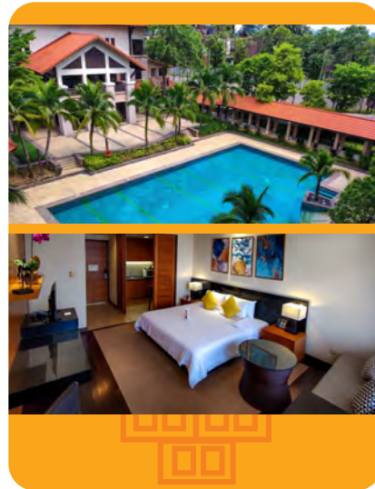
Lanai Kijang, Bank Negara Malaysia

5.0 KM, 13 minutes from Sasana Kijang, BNM https://www.marriott.com/en-us/hotels/kulmd-le-meridien-kuala-lumpur/