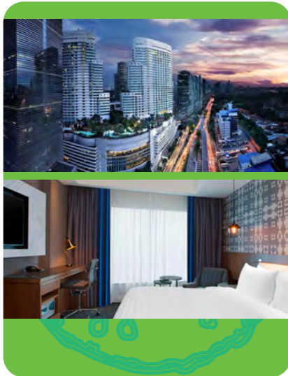
Le Meridien Kuala Lumpur

4.7 KM, 10 minutes from Sasana Kijang, BNM https://www.marriott.com/en-us/hotels/kulal-aloft-kuala-lumpur-sentral/overview/